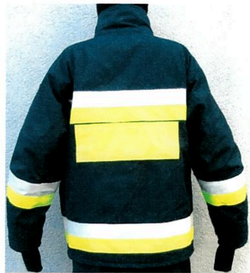
art. 841185-001008-FR, back side