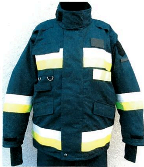
art. 841185-001008-FR, front side