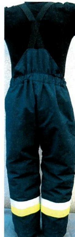
art. 842172-001008-FR, back side