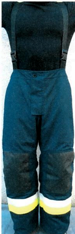
art. 842172-001008-FR, front side

High visibility tapes (retroreflective/silver and combined performance material or fluorescent yellow, 5 cm width): two bands encircling the torso, two bands encircling sleeves and trouser legs, one additional (area for marking) on back (version P ) or with additional vertical bands on back (version Z ). High visibility tapes (version M ) (retroreflective/silver, 5 cm width): one band encircling the torso; (fluorescent yellow, 5 cm width): one band encircling the torso; (fluorescent yellow / retroreflective silver / fluorescent yellow, 5 cm width): one band encircling sleeves, on the chest from the front side and two vertical on back, and one partly on the shoulder; (fluorescent yellow / retroreflective silver / fluorescent yellow, 7,5 cm width): one band encircling trouser legs.